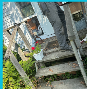
Rotting and rickety

www.bucksportbayhealth.org/safety-accessibility-home-repair