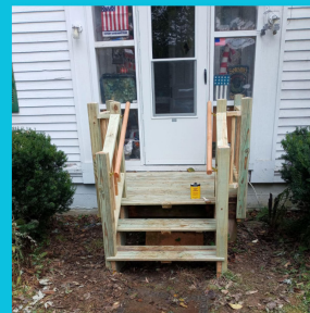
Safe and sturdy!